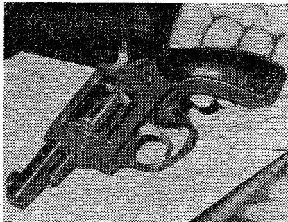
The .22 caliber revolver recovered from Sirhan.