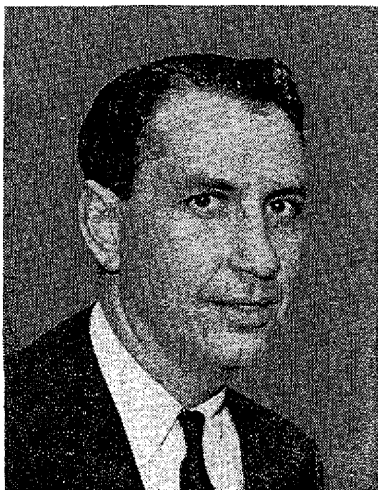
Specter: 'An open mind'

Several also denied that the burden of establishing the facts fell on Specter alone—or that his growing commitment to the single-bullet hypothesis had foreclosed any meaningful investigation of the two-gun alternative. "We had kept an open mind on the two-assassins theory throughout that phase of the investigation," Specter himself