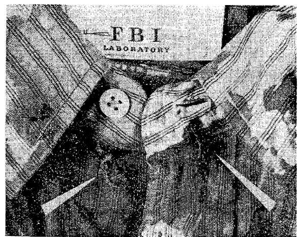
Did the bullet that pierced JFK's collar (right) enter through his neck (left)—or his back?