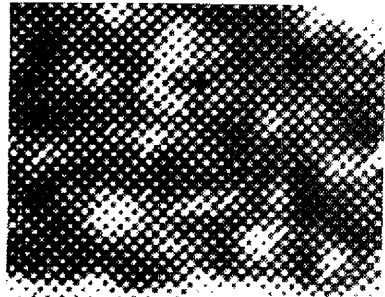
The photo at right is an enlargement of the Nix film and shows the outlines of what some investigators believe to be a jeep parked behind a concrete pergola on the grassy knoll. Also shown in the film may be the outlines of two men, one of whom was also captured in a separate photo taken at the same moment (above).