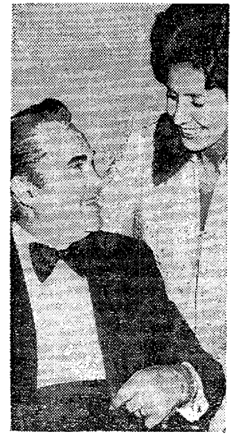
THE WALLACES No time for sadness.