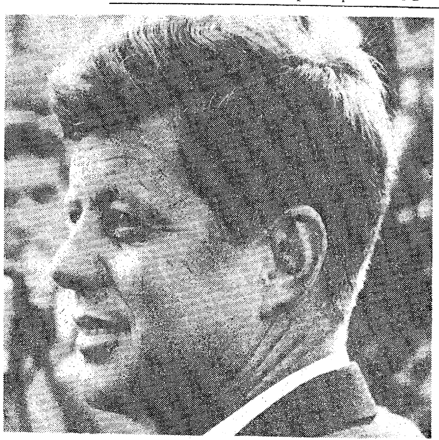
Sunday, Nov. 18, 1973 Philadelphia Inquirer 3-D