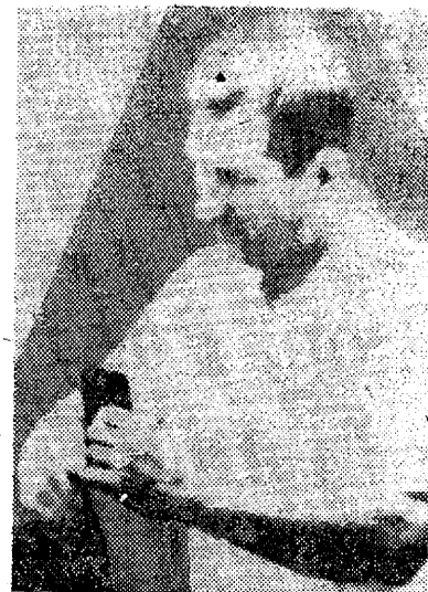
This man, photographed in Mexico City by the CIA prior to assassination, was at first identified by CIA as Oswald. He remains part of the unsolved mystery.

Texas State Attorney General Waggoner Carr and Dallas District Attorney Henry Wade relayed to the commission a story that Oswald had been