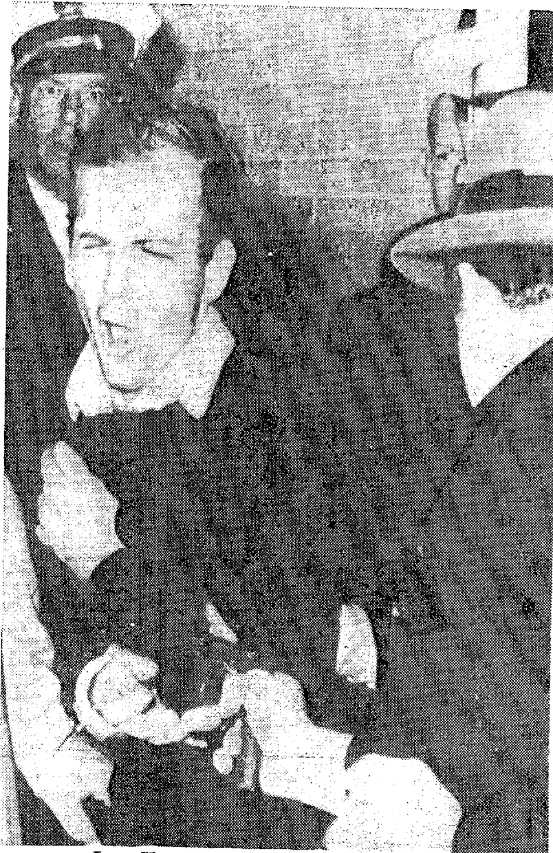
Lee Harvey Oswald (left), seized as the assassin, had little chance to shed light on the crime. This famous photo shows Oswald being slain two days after the assassination by Jack Ruby, a Dallas nightclub operator.