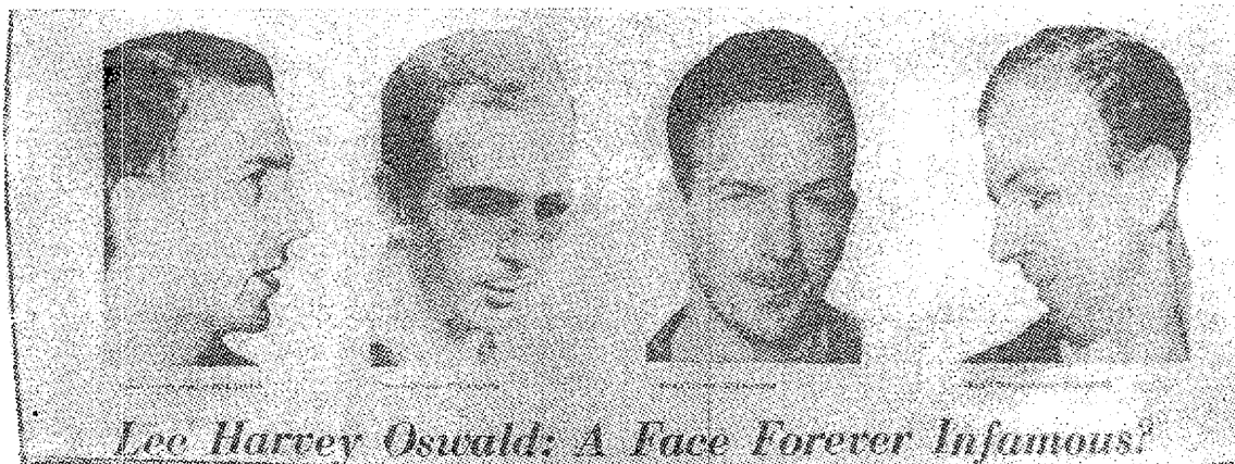
A SAMPLE HEADLINE—THIS ONE IN THE N.Y. HERALD TRIBUNE NOV. 24

Wade does explain, however, how the almost immediate description of Oswald was radioed to the police and to the citizens of Dallas. The explanation: "Every other employe was located but this defendant of the company." The New York Times (Nov. 23) reported: "About 90 persons were employed in the Texas School Book Depository and most of them were out watching the President's motorcade when the shots were fired." Police Chief Curry, who was riding in a car just 40 feet ahead of the limousine carrying the President, said he could tell from the sound of the three shots that they had come from the book company's building. Moments after the shots were fired, Curry said, he radioed instructions that the building be surrounded and searched