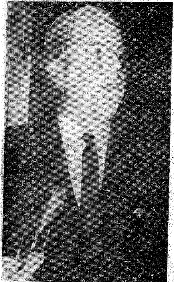
DALLAS DISTRICT ATTORNEY HENRY WADE He presents the 'evidence'—to the press

Wade: Yes, I've got paraffin tests that showed he