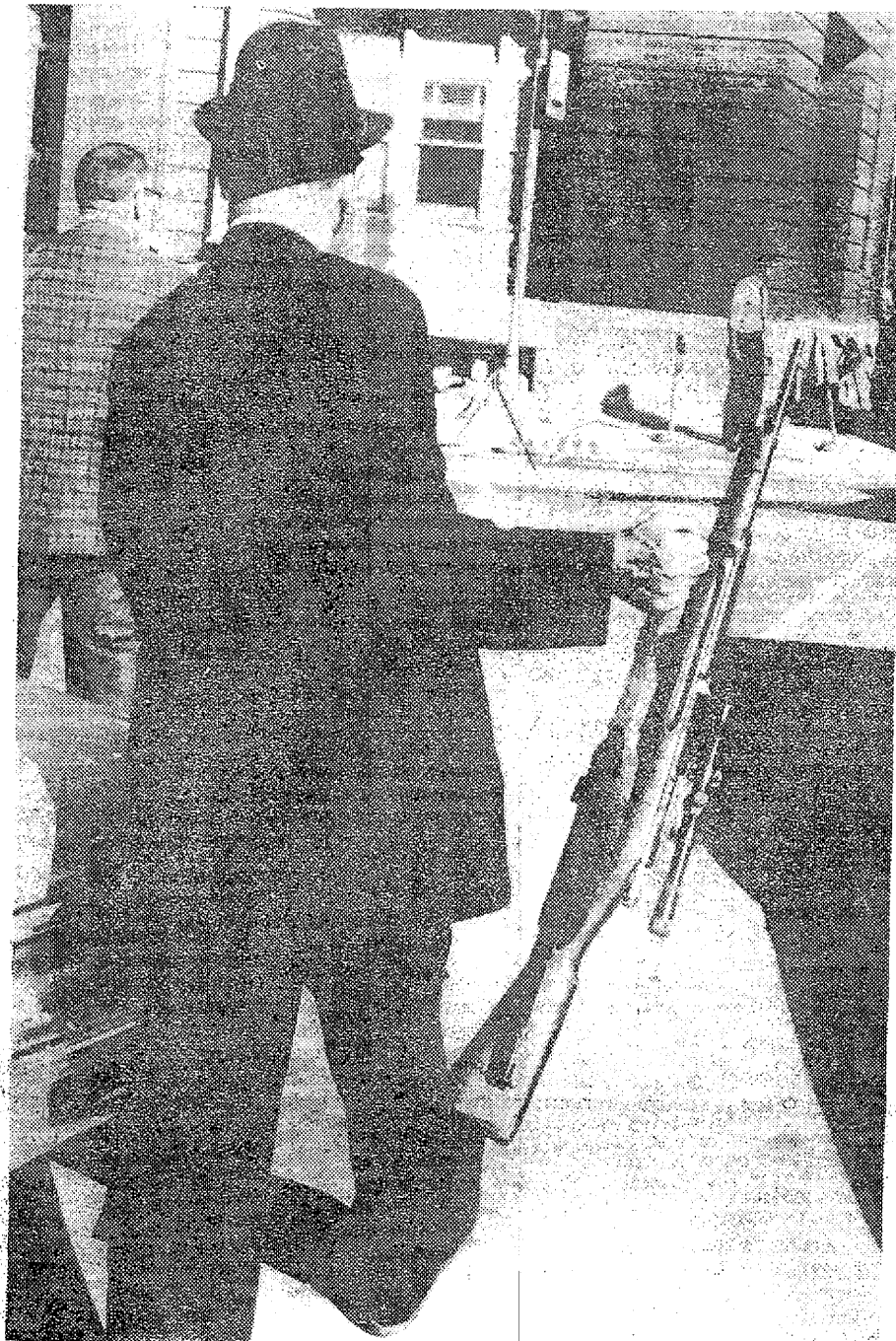
WAS THIS RIFLE THE KENNEDY ASSASSINATION WEAPON? The Dallas police had a flexible story. Details on Page 5