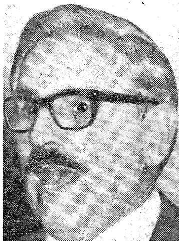
LATEST DEATH linked to the JFK murder is former Cuban president Carlos Prio Socarras.