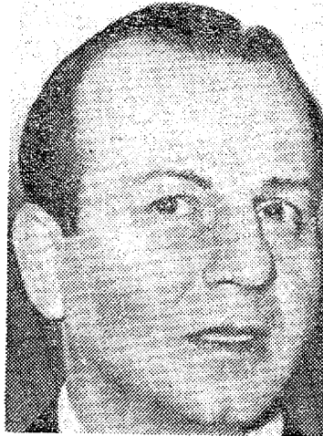
JACK RUBY: After his death from cancer, attorneys charged Dallas authorities with negligence.

During Jack Ruby's trial for murdering Oswald, columnist Dorothy Kilgallen had a 30-minute private interview with