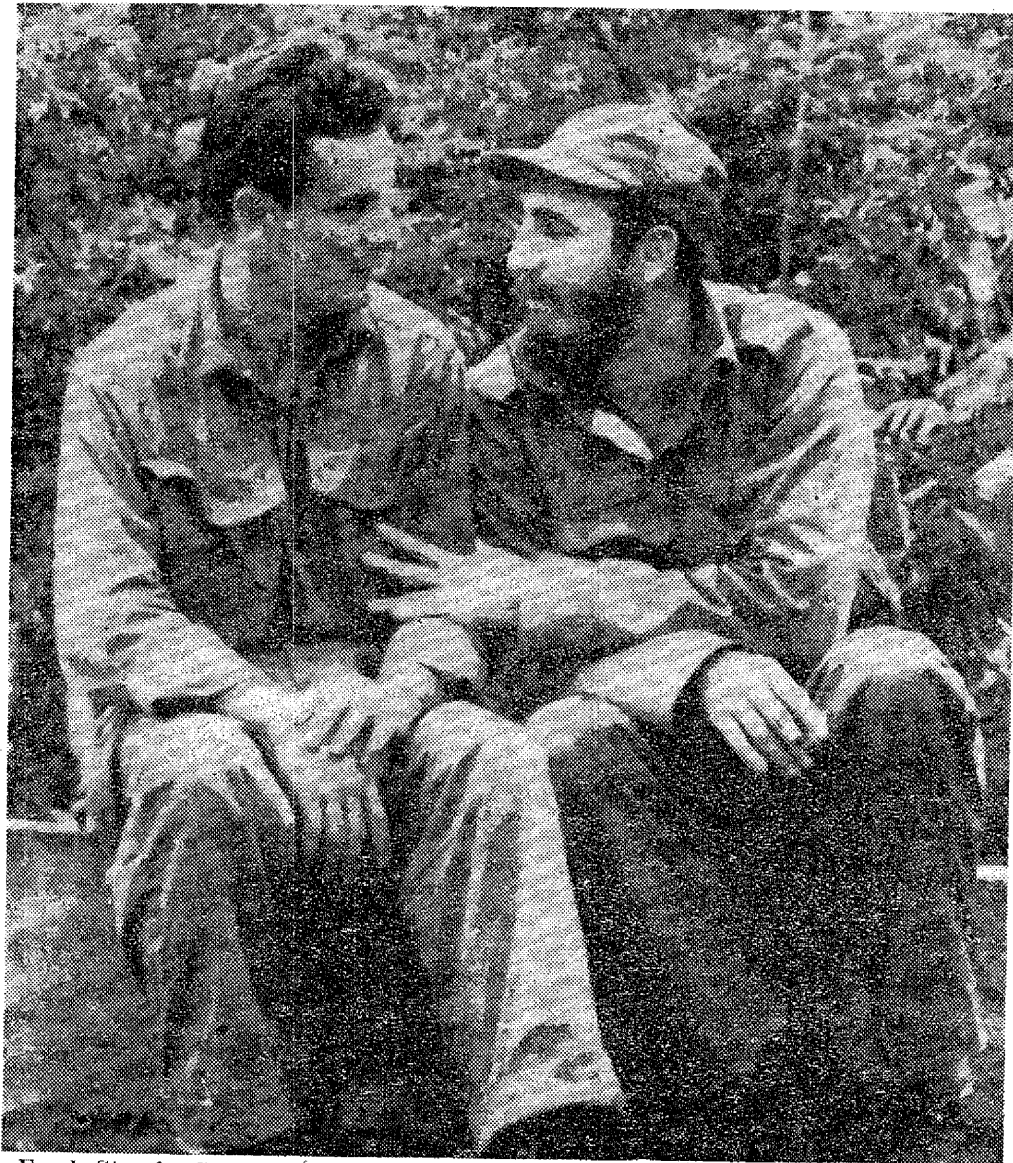
Frank Sturgis, Cuban counter spy and later one of the Watergate burglars, chats with Fidel Castro in Havana in 1957.