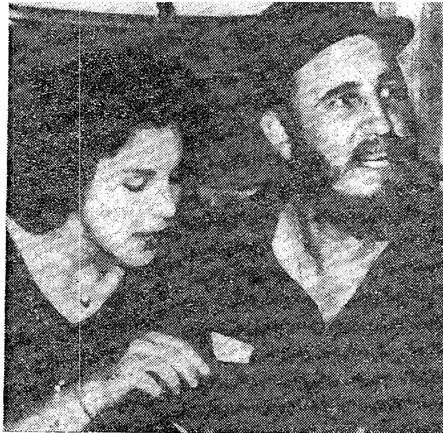
Marita Lorenz with Fidel Castro in 1959 when he was her lover.