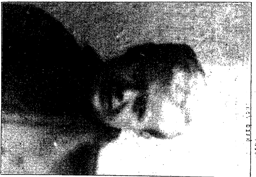
WANTED: Information on the whereabouts of the three men pictured above. The House Select Committee on Assassinations is seeking to question the men in connection with its investigation into the deaths of President John Kennedy and Dr. Martin Luther King. The photo at left was taken in Dealey Plaza, Dallas, moments after President Kennedy was shot. The two other men may have been in Mexico City in the fall of 1963 when Lee Harvey Oswald was there. Anyone with information about these men should contact the House Select Committee on Assassinations, Washington, D.C., 20515.