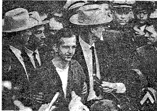
KENNEDY'S ASSASSIN, Lee Harvey Oswald, is flanked by Dallas police after being arrested for killing President John F. Kennedy.

link to three other figures in the JFK assassination is traced to her.