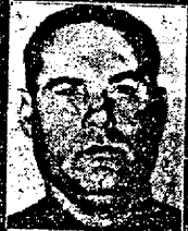
Killam: throat cut