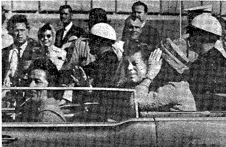
JFK RIDING IN MOTORCADE in Dallas next to wife Jackie and behind Governor and Mrs. John Connally of Texas. Only seconds later, the President was shot.

The Admiral expressed a wish that the body be disfigured as little as possible, because of the Kennedy family's