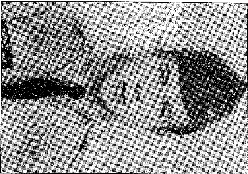
Lee Harvey Oswald