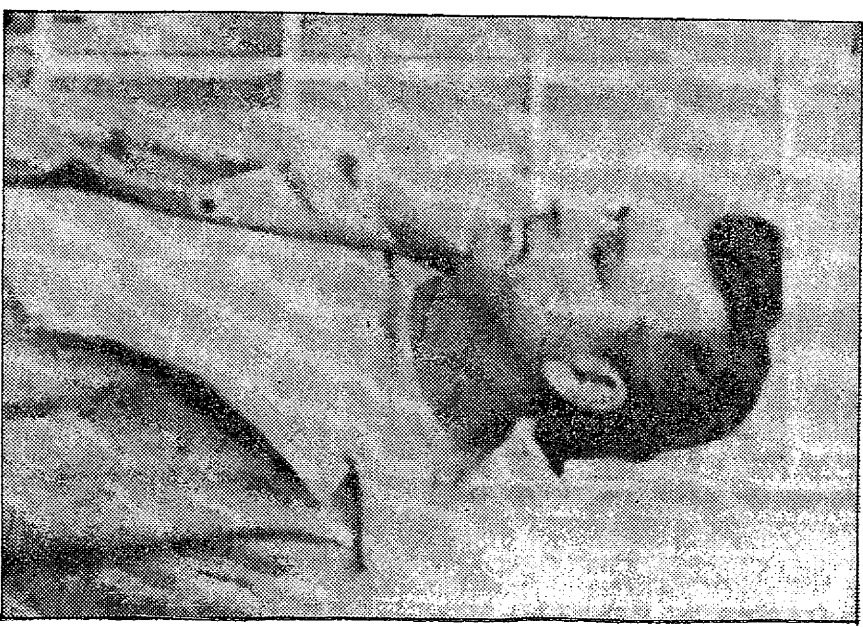
James Earl Ray