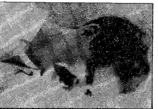
LEE HARVEY OSWALD