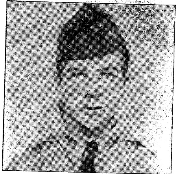
LEE HARVEY OSWALD in his Civil Air Patrol Cadet uniform at which time he first came in contact with those who would later be allegedly implicated in a conspiracy to assassinate the President.