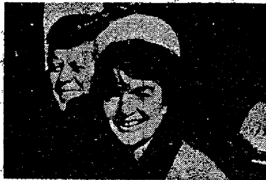
President Kennedy and his wife leaving for Dallas, Texas, on the day he was killed.

THEY MIGHT KILL ME— INQUIRY'S ONLY SURVIVOR