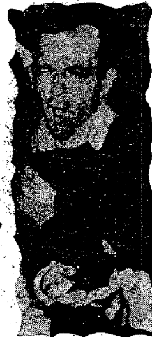
Two days after President Kennedy's death, Lee Harvey Oswald, the assassin, was shot dead by Jack Ruby.

THEY MIGHT KILL ME— INQUIRY'S ONLY SURVIVOR