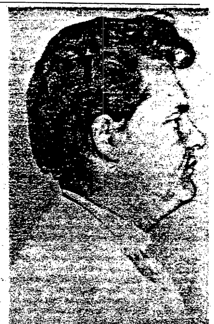
WAS THIS JFK'S ASSASSIN? —Photo at left, taken by a newspaper photographer on Nov. 22, 1963, shows two of the three "tramps" arrested in the railroad yards near the Texas School Book Depository in Dallas immediately after President John F. Kennedy was fatally shot. Neither the