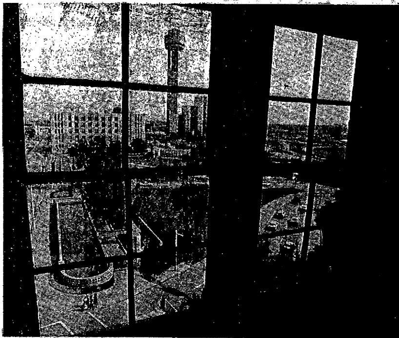
The view from the old Texas School Book Depository sixth floor.