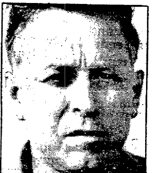
James Earl Ray... charges that the lie-detector test, administered by a Chicago firm, was "rigged."