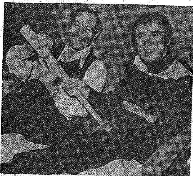
Soft-Core Pornography of the Month Oakland A's Gene Tenace plays with Jim Nabors' bat