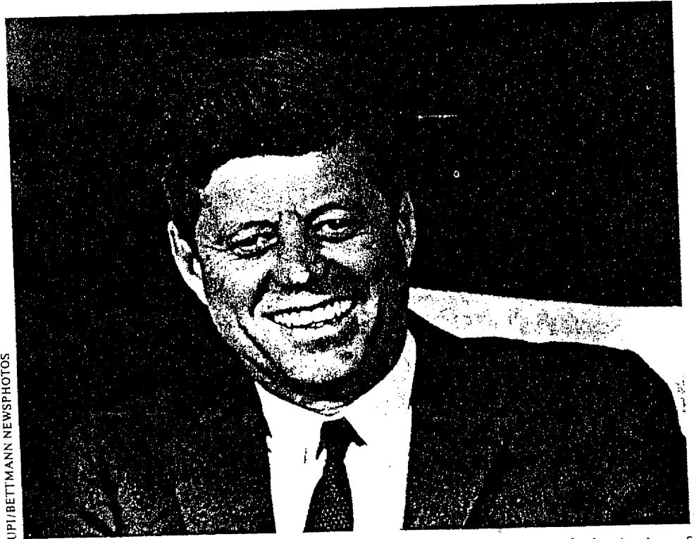
The brief burst of gunfire in Dealey Plaza on November 22, 1963, was the beginning of a massive cover-up which, at last count, had claimed nearly 200 lives.

"Right after he shot Oswald, as he was being grabbed by law enforcement officers, Ruby reportedly said, 'You don't have to beat me — my brains out. I'm Jack Ruby. What am I doing here? What are you guys jumping on me for? Why am I here? I'm Jack Ruby. I'm not somebody that's wanted.'"