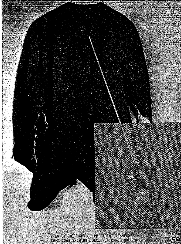
VIEW OF THE BACK OF PRESIDENT KENNEDY'S SUIT COAT SHOWING BULLET ENTRANCE HOLE

The alternative is that the FBI was wildly inaccurate, in both its reports, in describing the wound. If the FBI made an error of that magnitude on a crucial issue of evidence, in a crime of such supreme gravity, the whole Warren Report—resting as it does almost entirely on FBI investigative and scientific findings—comes into question.