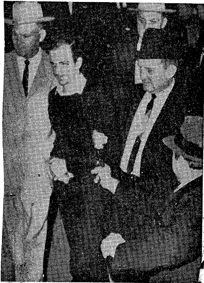
The shooting of Oswald.