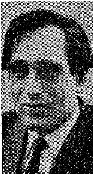
EDWARD JAY EPSTEIN

tion concerns what he regards as the irreconcilable split between the commission's function, "which was to ascertain the facts," and its "ultimate purpose," which was "to protect the national interest by dispelling rumors." If there had been no conflict between function and basic purpose—in other words, if there had been no truth in any of the rumors which sprang up after the assassination—there would have been no difficulty. Since this was unfortunately not the case, in Epstein's view, the commission had to make a choice, and it allowed its investigation to be dominated by the desire to dispel rumors at the expense of fearlessly searching for the truth.