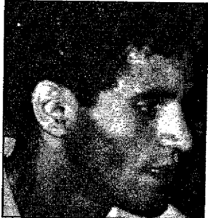
HE IS LED AWAY TO JUDGE AFTER SHOOTING.

"Sirhan has been wooed by militant Arab groups, but has not responded to them. If he were to cooperate, there would be a chance of rescue by them."