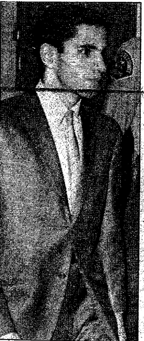
HE ARRIVES FOR TRIAL IN 1969.