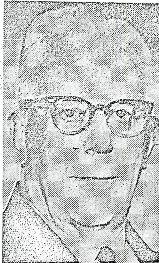
CHIEF JUSTICE WARREN The report left many questions un-answered

I have met this Texas editor myself and I know that he has been warned by certain American secret service agencies not to reveal some of his informa-