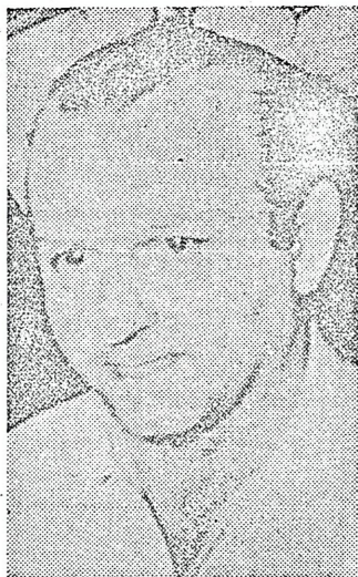
JACK RUBY Was he hired to kill Lee Oswald

tion. Some time ago, indeed, he removed his papers from his home and had them lodged in a certain bank vault in the United States.