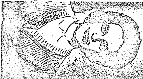
Marina in 1965

"I don't want to believe, but I have too much facts, and facts tell me that Lee shot Kennedy," Marina told the Warren Commission in 1964. "I think he