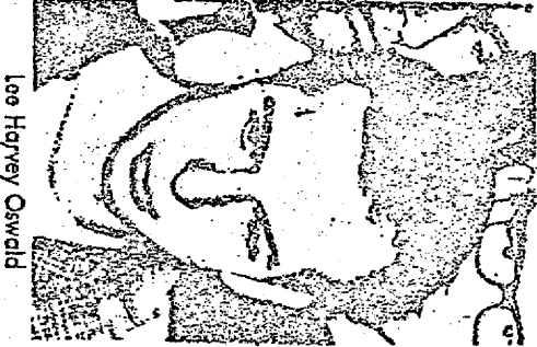
Lee Harvey Oswald