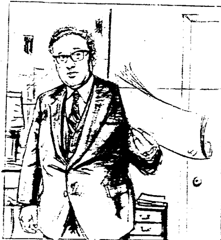
Colby handed Kissinger the “family jewels.”

those storms. It seemed to me that we could do so again—if we handled the present crisis in a calm and sensible way. And in my view, the calm and sensible way in this case was to counter the distortions and exaggerations of Hersh’s article by publicly telling the true story of Operation Chaos and the rest, conceding the Agency’s few misdeeds in the past, explaining how they had come about, emphasizing that they were few and far between and of a relatively minimal nature, and, above all, stressing that they had been terminated by the Agency itself and reported to Congress in 1973 and that nothing of the sort was going on now nor would anything like it take place in the future. More than anything else, it was the CIA’s experience in Watergate that led me to this strategy.