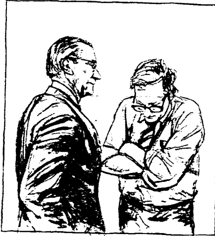
Colby with Seymour Hersh of The Times .

I felt I owed Hersh the interview he requested and could trust his responsibility.