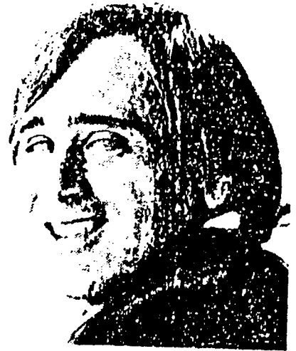
EDWARD JAY EPSTEIN

He said it was a "possibility," however, that "some hothead" in the Cuban Embassy in Mexico City suggested to Oswald in early October, 1963, that he "do some act" and that Oswald then de-