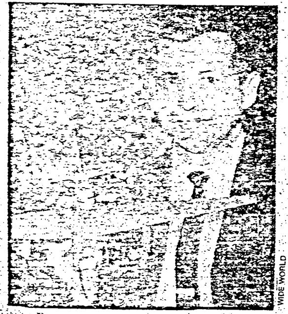
Powers: What brought his U-2 down?

raises the question of Oswald's activities in his own book Operation Overflight: During the six months following the October 31, 1959, embassy meeting [between Oswald. and American consular officials in Moscow] there were only two overflights of the USSR. The one which occurred on April. 9, 1960, was uneventful. The one which followed on May 1, 1960, wasn't." The May I flight was, of course, made by Powers, when he crashed.