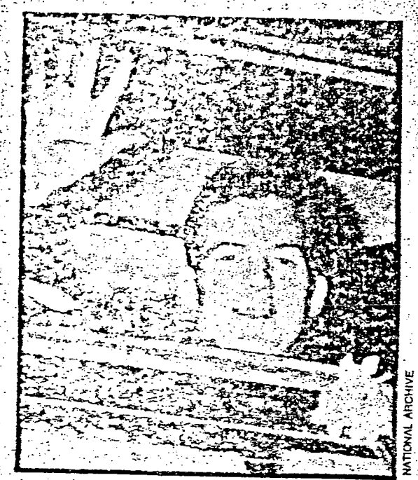
Oswald returning from the USSR: What did he tell them?