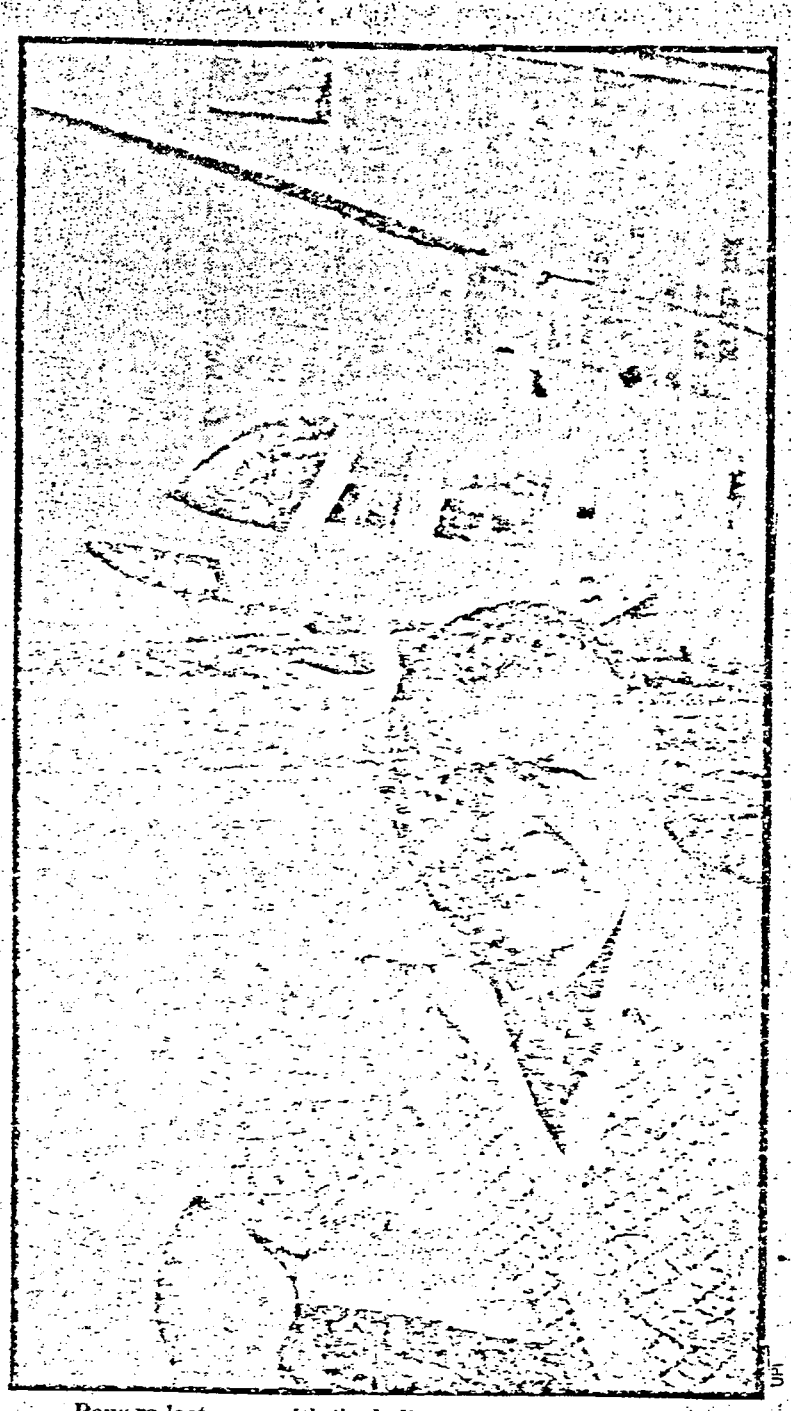
Powers last year with the helicopter in which he died.

is that Oswald gave the Soviet officials enough that the CIA knew, following Osdetailed technical information, which enabled them to shoot down the plane. And, indeed, CIA officials have subsequently claimed that what Oswald disclosed were details of the radar countermeasure beam emitted by the U-2 which would have thrown Soviet tracking devices off target. They suggest that once the Russians knew details of the counterbeam they used it to track their rocket up to the U-2 itself.