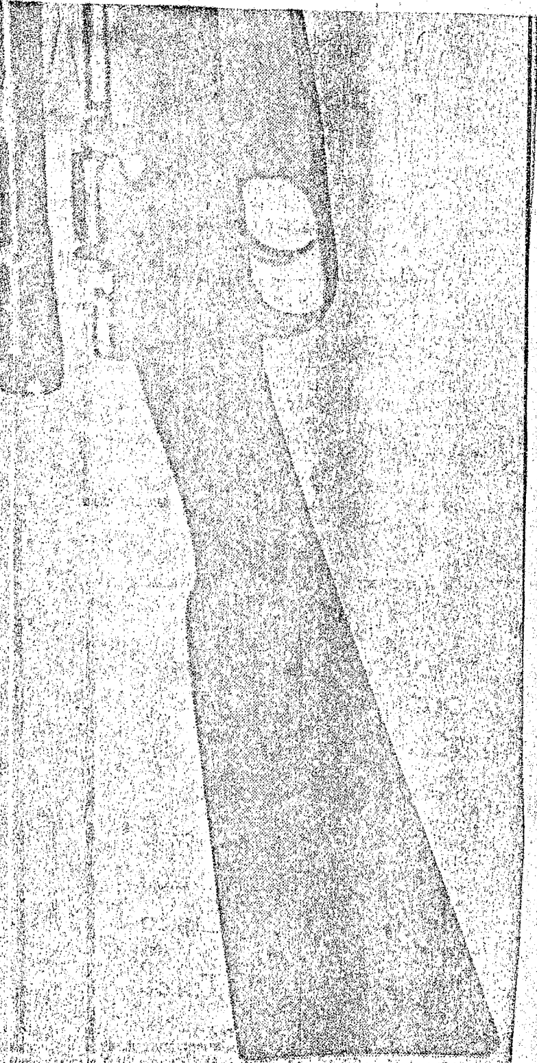
The rifle that killed President Kennedy