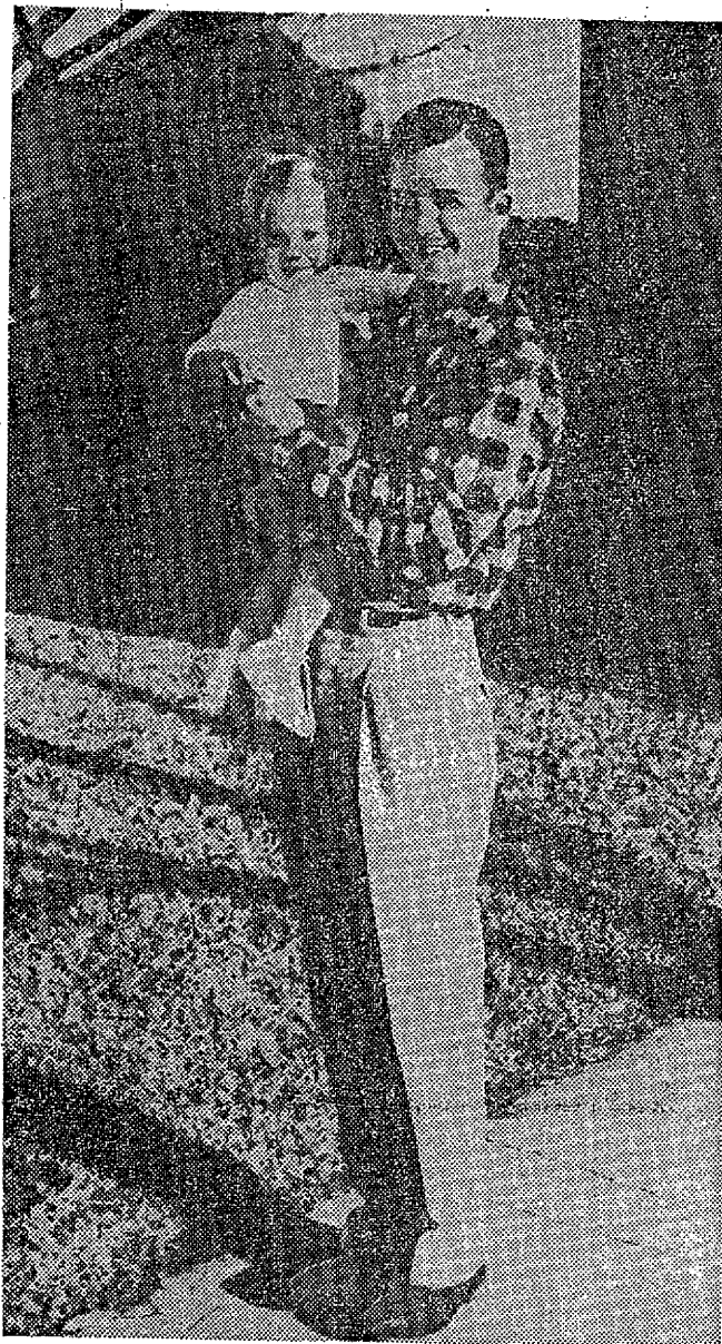
Included in the book "Lee," by Lee Harvey Oswald's brother Robert, is this photograph of the presumed assassin, taken in 1959. Lee Harvey Oswald is shown holding Robert's daughter.