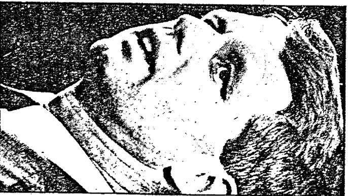
RFK: did pro-Israeli stance lead to his death?