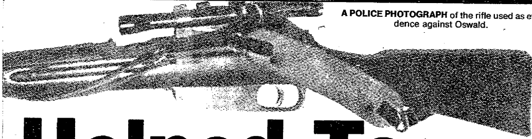
A POLICE PHOTOGRAPH of the rifle used as evidence against Oswald.