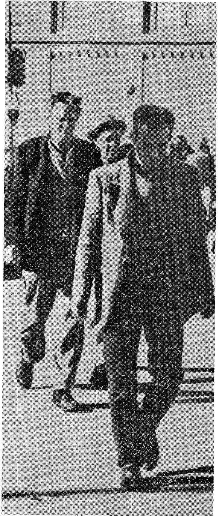
Another view of the two with head of a third man also under arrest.