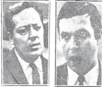
Jim Garrison Prosecutor and chief witness

insurance salesman from Baton Rouge, described how Ferrie had discussed in detail how to kill Kennedy and how to make a getaway. But in the recording Russo said that Ferrie had talked "in a joking way" of killing the President. He said Ferrie "used to say" just jokingly that you and I could do it."