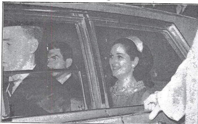
Lynda Bird Johnson and actor George Hamilton sit in limousine in front of the Winter Garden Theatre last night as they left after seeing the hit musical, "Mame." Secret Service men sped them away.