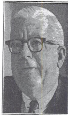
Secretary Fowler Presents tax proposals

Although some leading economic indicators have been slipping, Fowler maintained that the Administration wanted Congress to act now because the very special-