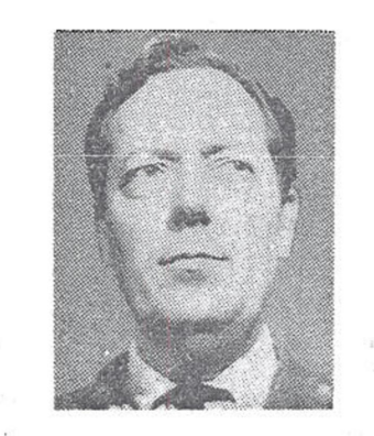
DIST. ATTY. GARRISON · · · details