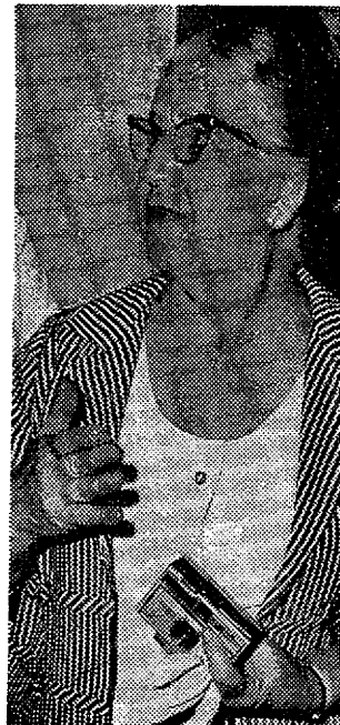
SPECTATOR —Mrs. Marguerite Oswald, mother of presidential assassin Lee Harvey Oswald, is among spectators in District Court in Dallas for the sanity hearing of Jack Ruby, the man convicted of slaying her son.