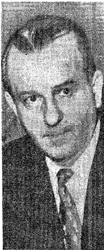
JACK RUBY Conquered by Cancer

covered malignancy in both lungs, the liver and the pancreas.