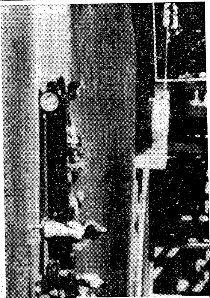
Picture at left, from files of United Press International, is said by Esquire magazine article to show (upper left corner) a vehicle with a man leaning on its roof at moment President Kennedy, in car in foreground, is being shot. Picture at right is a blowup from the section in question

The controversy arose over one frame of an eight-millimeter color film by Orville O. Nix, a Dallas employee of the Federal General Services Ad-