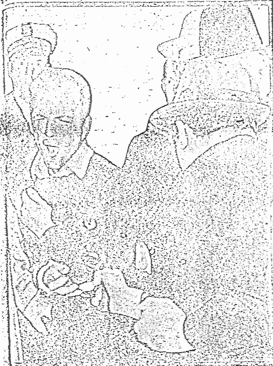
One day I'm convinced that Oswald and Oswald alone did it. Then you get new leads and other information and you're not sure."

you get new leads and access to information and you're not sure." In interim committee report, due in weeks, will not reach any conclusion on the killing, but it may have something to say about the thoroughness — or lack of it — of the FBI investigation and the Warren Commission.