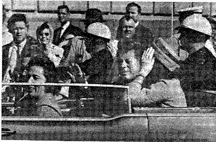
JFK RIDING IN MOTORCADE in Dallas next to wife Jackie and behind Governor and Mrs. John Connally of Texas. Only seconds later, the President was shot.