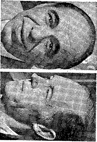
Rep. Henry Gonzalez (left) and Howard Hunt (right). This Watergate figure keeps cropping up, says Gonzalez.

The resolution would direct the special committee "to conduct a full and a complete investigation and study of the circumstances surrounding the death of John F. Kennedy, Robert F. Kennedy and Martin Luther King and the attempted assassination of George