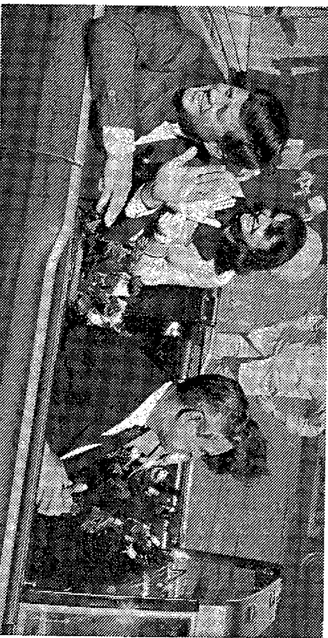
SMILING JFK sets out on his ill-fated tour of Dallas in 1963 with wife Jackie. Then-Texas Gov. John Connally (in front seat) was also shot.