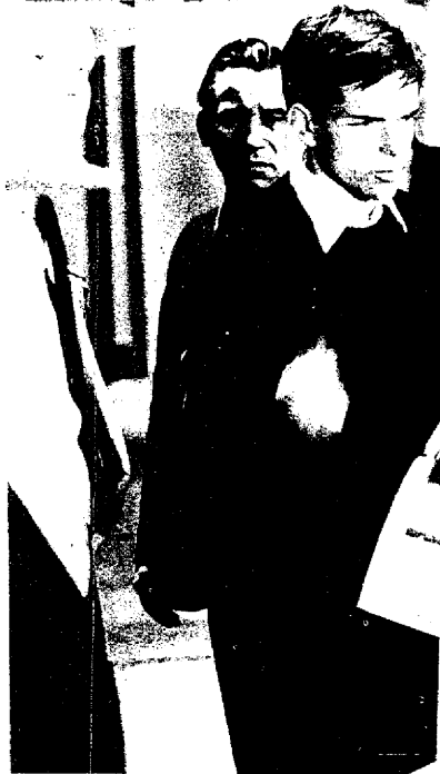
Director Rudolph Cartier (r) and star, Tony Bill (c) carefully reconstruct scene when Oswald was shot.