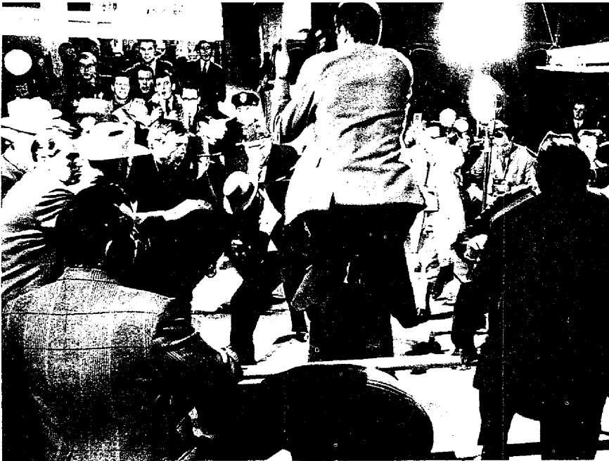
After shooting, Oswald, still handcuffed to FBI escort, staggers, mortally wounded, still only a few feet from Ruby, his murderer, who is now being dragged away by police.