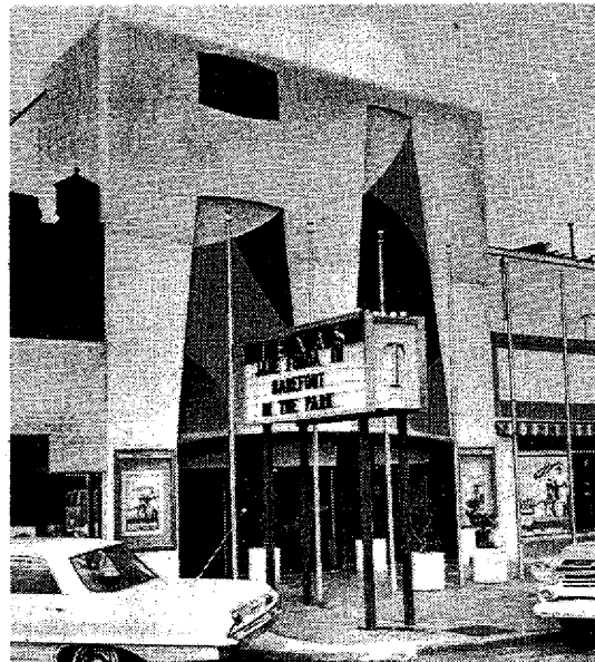
Bad day in Big D: Some mourned Kennedy, others peered at the theater where Lee Oswald was captured