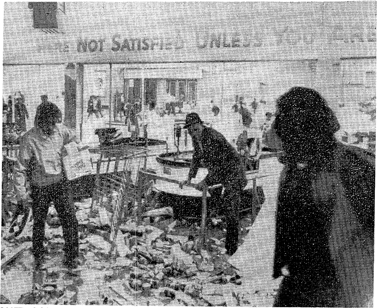
LOOTERS helping themselves to food on Friday in a supermarket at 14th Street and Park Road, northwest Washington