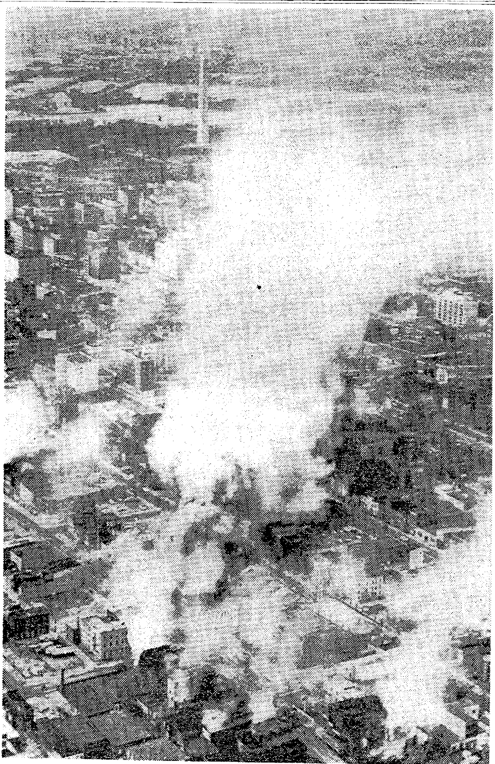
IN NORTHWEST AREA of Washington, smoke rises from burning buildings on Seventh Street, obscuring White House at top left. To left are Washington Monument and, near the edge of the Tidal Basin, the domed Jefferson Memorial. This view is toward Virginia.