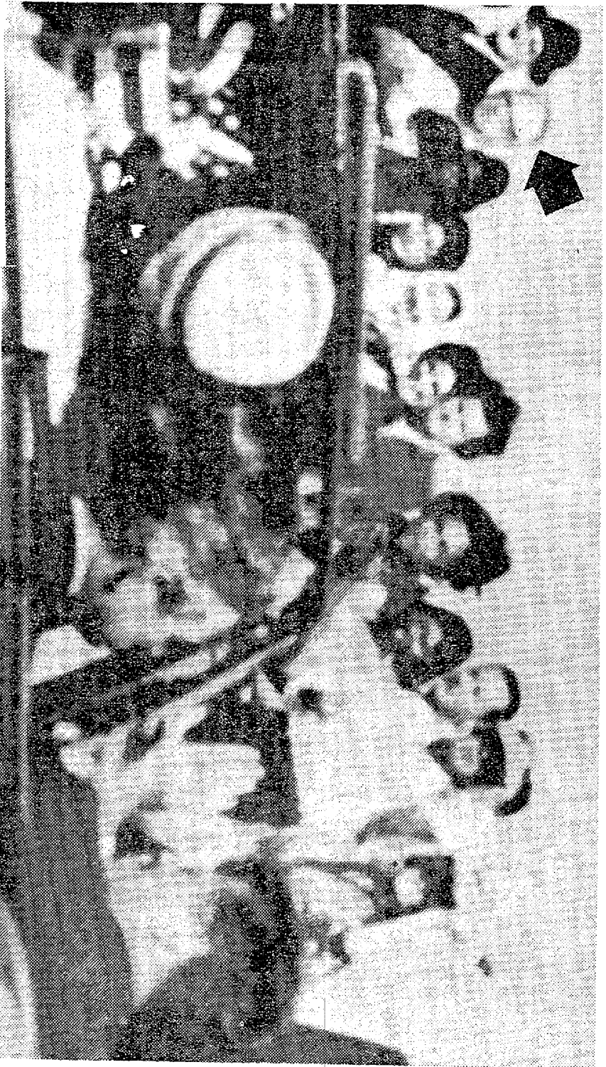
JFK MOTORCADE rolls through Dallas on fateful day as man (arrow) looking exactly like right-wing activist Joseph A. Milteer (left) watches the President's car. Just 13 days before, Milteer disclosed — with chilling accuracy — the plot to murder JFK.