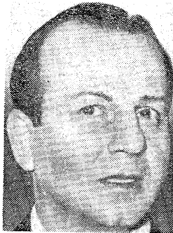
JACK RUBY: After his death from cancer, attorneys charged Dallas authorities with negligence.

During Jack Ruby's trial for murdering Oswald, columnist Dorothy Kilgallen had a 30-minute private interview with