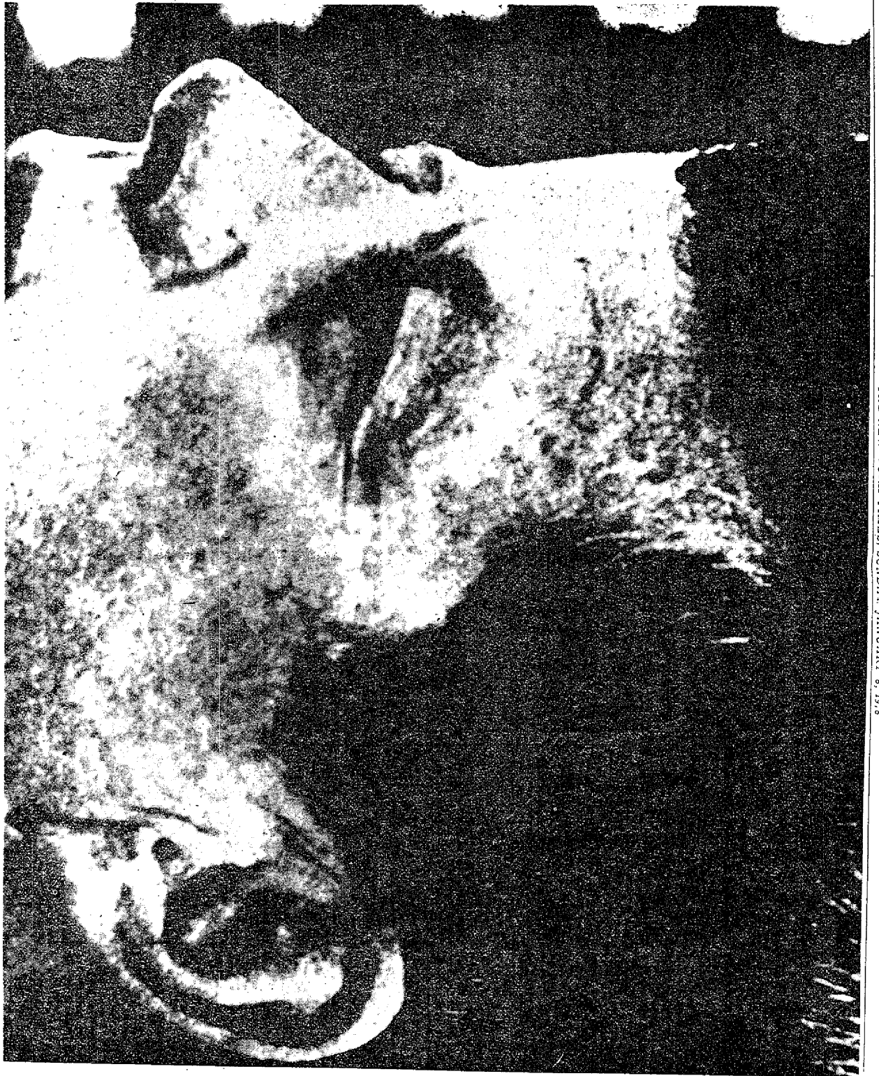
THE NEW YORK TIMES, SUPPLEMENT, JANUARY 6, 1916