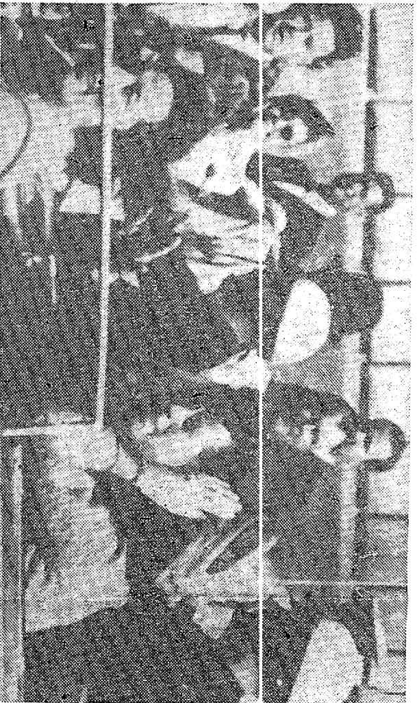
President John F. Kennedy one minute before he was fatally shot in November, 1963.

For the dozens of Warren Report critics and independent investigators of the assassination, the committee's basic conclu-