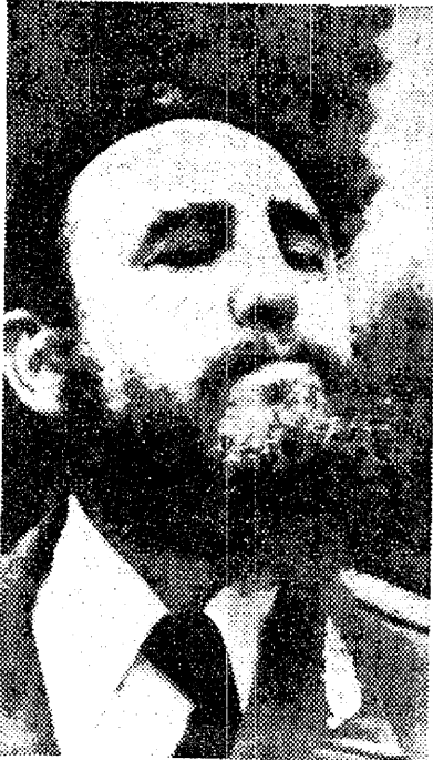
Fidel Castro: Mafia target.

political member of the National Security Council's so-called 5412, or Special Group, which would essentially decide (during Eisenhower's illness) what U.S. policy would be toward Castro. Nixon interviewed Castro privately when Castro came to New York to the United Nations in 1959 and concluded